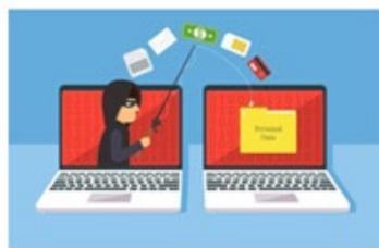
What is phishing?

Scams and other cyber security risks are on the rise, and one must be cautious and aware on how to identify them. For this reason, it is very important that one stops, looks and thinks before proceeding. Below, one can find some tips on how to be more secure while surfing the internet or using portable devices.