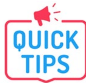
Tips for Safer Banking